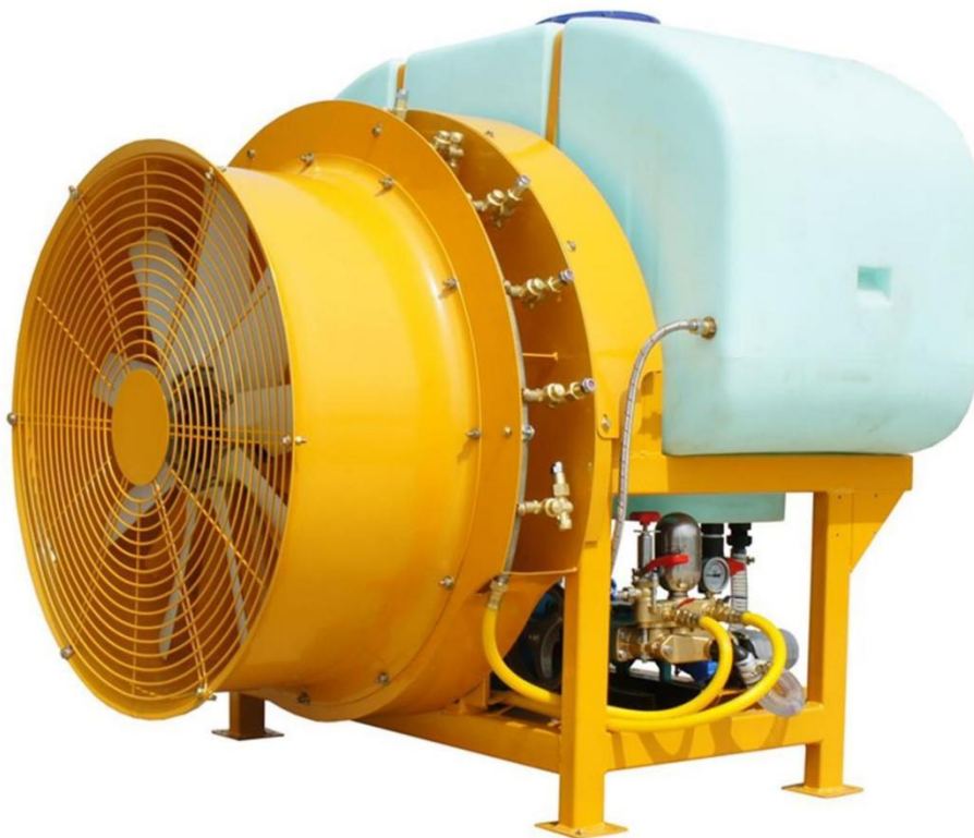
3WFX-360 whole machine picture

Sprayer range: height 2-5 m/ width 6-10m