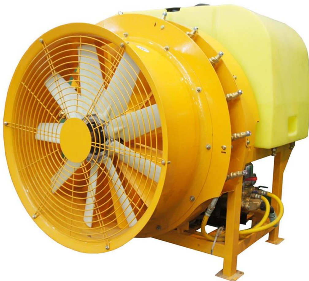
3WFX-400/500 whole machine picture