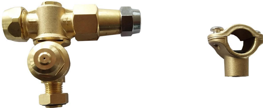
Sprayer nozzle: from Italy Copper body, ceramic spray, independent switch, two flow options