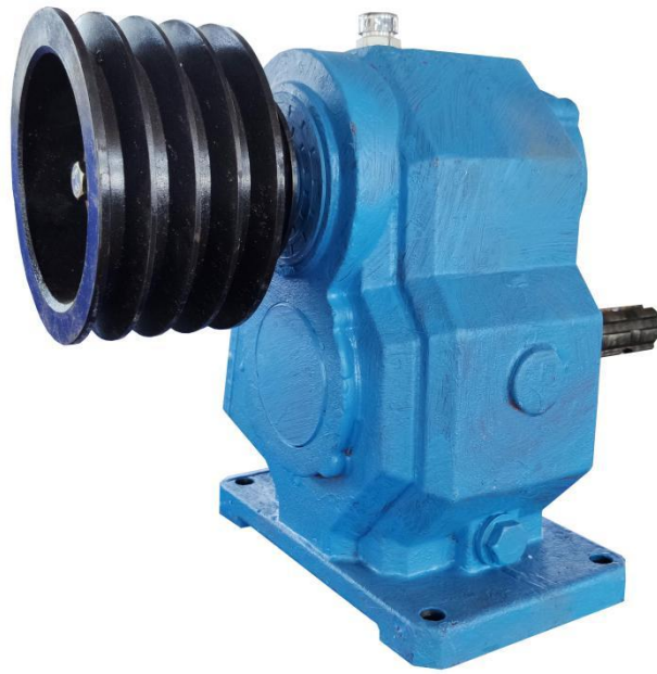
Configuration gear box (the warranty time 2 years).